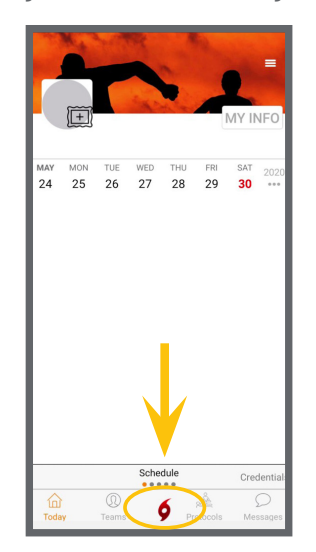
Step 1: Tap the hurricane icon on the Today page and then select the icon that says 'Connect to your school!'